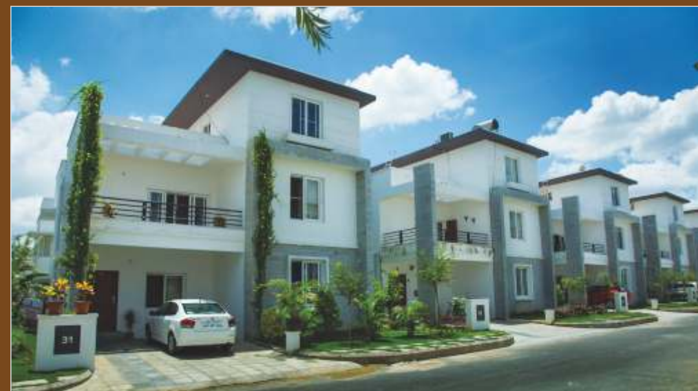
KEERTHI RICHMOND VILLAS