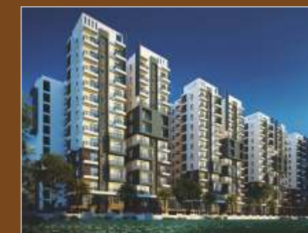
KEERTHI ROYAL PALMS