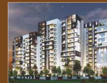
KEERTHI SURYA SHAKTHI TOWERS