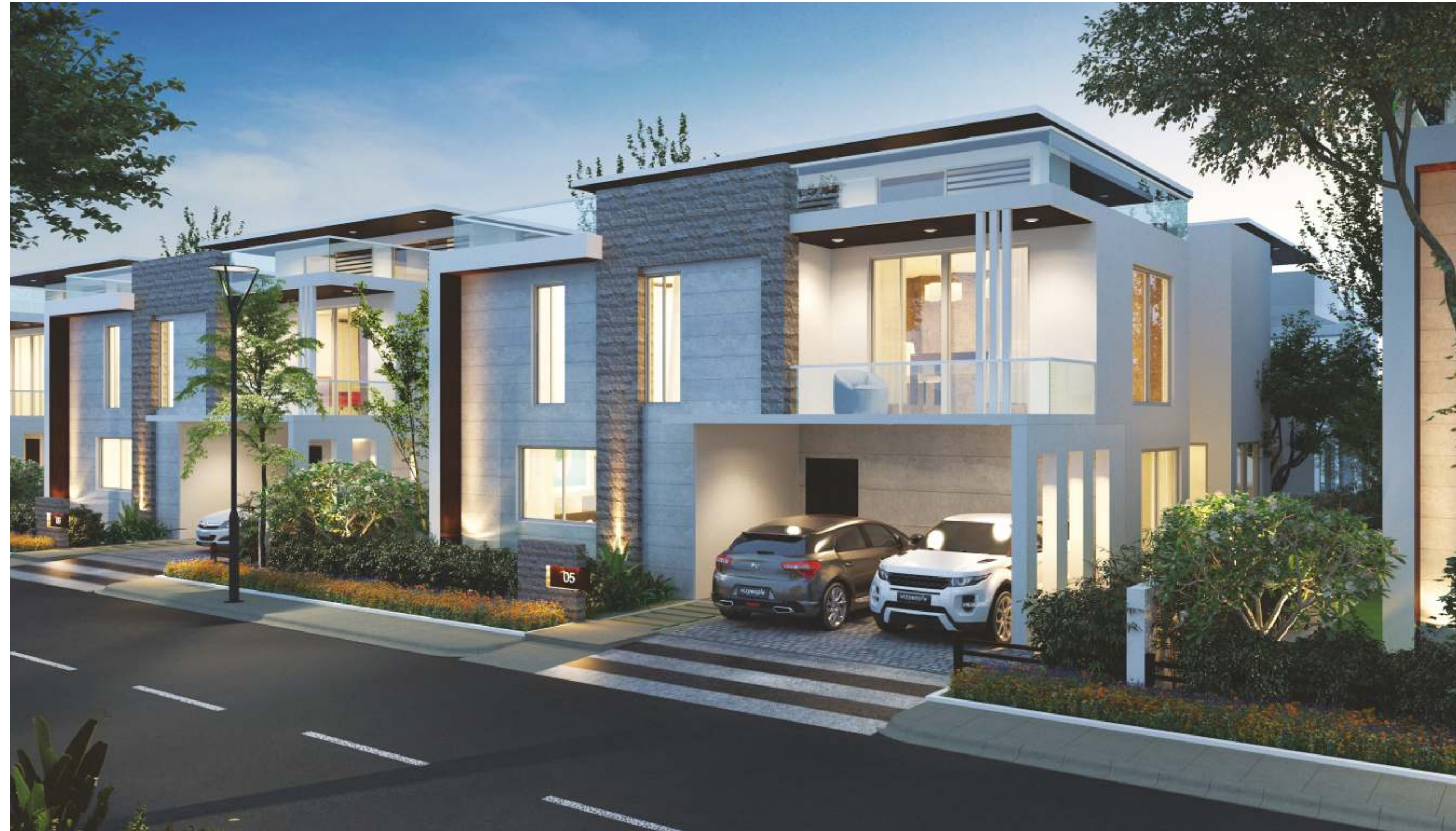
EAST FACING STREET VIEW